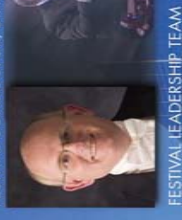
FESTIVAL LEADERSHIP TEAM